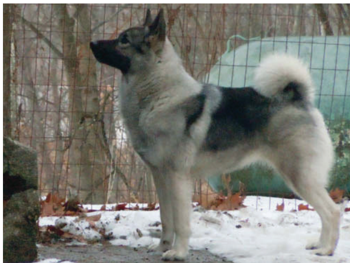
FIGURE 9 • ELKHOUND