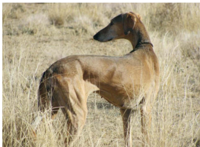
FIGURE 2 • SALUKI TOPLINE

square, and very few measuring longer than tall or rectangular. In a nutshell, I look for a compact hound and since muscle is always 'rounded,' the dog has a smooth, curvy, short-coupled look, a topline and underline which says to me: this Saluki is ready to spring into action, to turn and leap and avoid obstacles while running at great speed. Salukis are awesome athletes and judging in the show ring should build on their long and unique history."