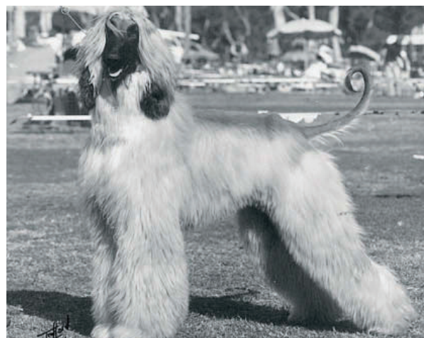
FIGURE 3 • AFGHAN HOUND

withers or not, there is a definite convex shape to the loin indicating strong back muscles. What is not found in Saluki athletes is the withers in the form of a straight ski-slope: a slide from neck to back also referred to as 'high withers.' A long or deep pelvis is also ideal allowing for maximum muscle attachment. Remember, muscles are the active element in locomotion. One of several old Arab standards calls for "the main slope of the body to be from the tail to the shoulder, an arched back with spine showing is considered a sign of speed." This type of topline is referred to in a dog show context as 'high in the rear' which for reasons unknown to me is faulted. It shouldn't be. Whereas a slope downwards from withers to rear should be faulted because it indicates weak hind quarters. Since I have measured a large number of Salukis as well as other running dogs over the past 20 years, I can state that the overall proportion of Salukis is taller than they are long, some measuring