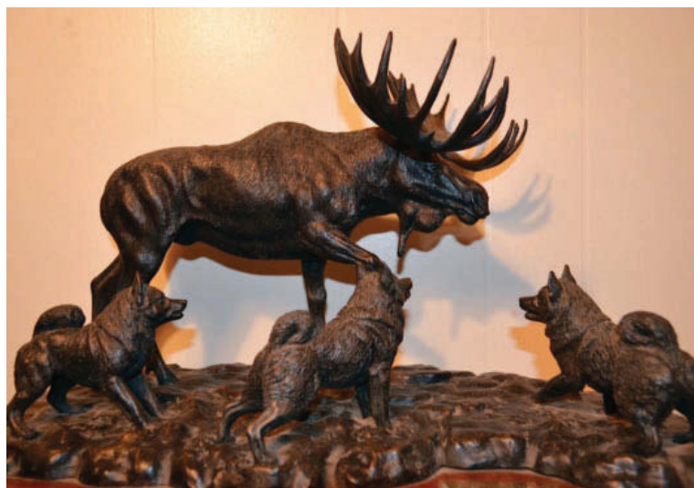
FIGURE 10 BRONZE OF MOOSE AND ELKHOUNDS AT BAY