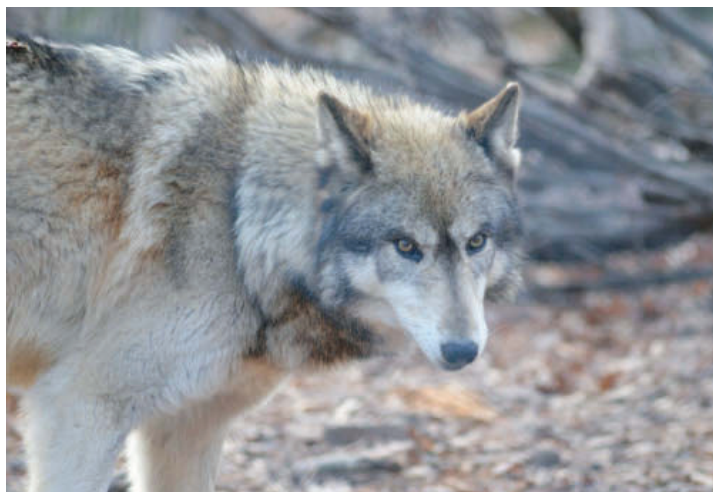
FIGURE 5 • WOLF