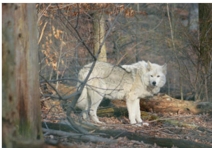
FIGURE 6 • WOLF IN PROFILE

sualize herding dogs and how they lower their heads while on the move, herding, driving flocks with body language and eye contact. The lowered plane is typical for herders penning, driving, directing frightened livestock. Hence, man's selected traits resulted in these drovers necks naturally fitting lower into the shoulder assembly and spinal column. In contrast, most sighthound cervical neck vertebrae are not situated as low as shepherding dogs and, importantly, sighthound scapula blade placement are not set as obliquely as almost all other breeds.