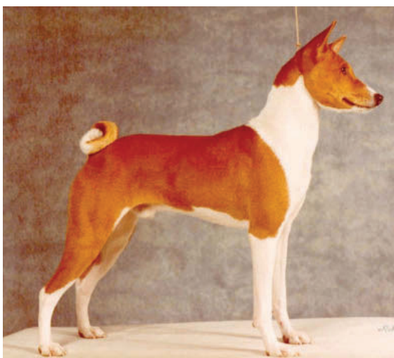
FIGURE 8 • BASENJI

means that the withers and croup should be on the same plane. In order to maintain flexibility the back should be slightly lower than the withers and loin. In recent years the show fads have created basenjis with two glaring faults. The upper arm is too straight and too short in relationship to the scapula. The rear assembly has been exaggerated in length of bone and angulation. The basenji is supposed to be a moderate breed and not as extreme as most other sighthounds. In order to keep the overpowering rear from tramping on the too straight front the back has been lengthened in many cases. The basenji